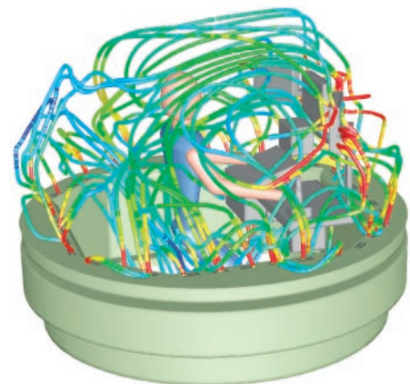
By adding a deflector near a laterally mounted vent, pathlines show that the flow is now acceptable